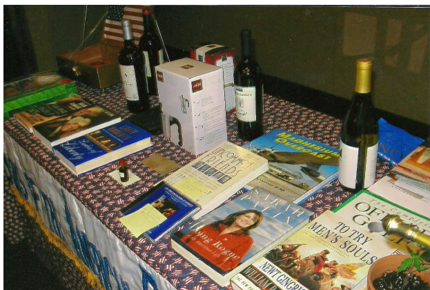
Prizes for our monthly raffle. Two different angles.