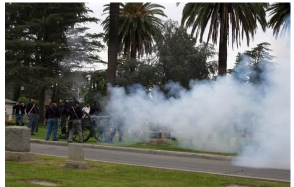
The Civil War artillery fire their cannons a couple times during the ceremonies.