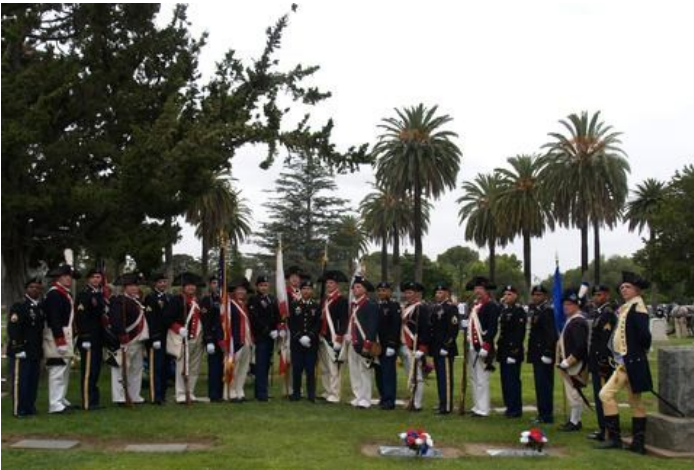
The past and the present come together as the Lee's Legion Color Guard is joined by the Honor Rifle Salute firing party—Soldiers from the 11th Armored Cavalry Regiment Blackhorse Troopers, Fort Irwin, CA