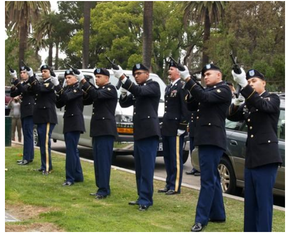
The Honor Guard Firing Party fires off one of three volleys of a 21 gun salute.