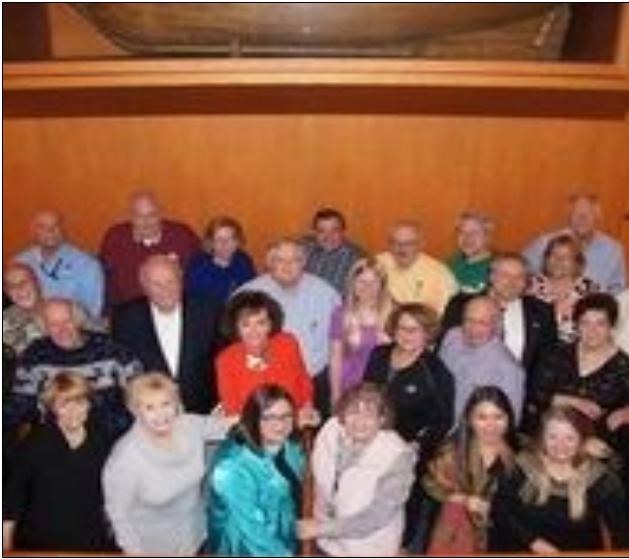
The members and their family who participated in the SAR Western Conference trip to Alaska.

arrived in Skagway at 7am. Many different experiences were offered and this would be our last port until we arrived at Seward on May 22nd. We left Skagway at 9pm and headed for Glacier Bay. We went up the bay and saw pods of whales gliding along just beneath the water. Once in awhile we would see one that spouted off. We saw several glaciers and even some calving took place at one of them. By 4pm we had exited Glacier Bay and would be at sea all day on the 21st.