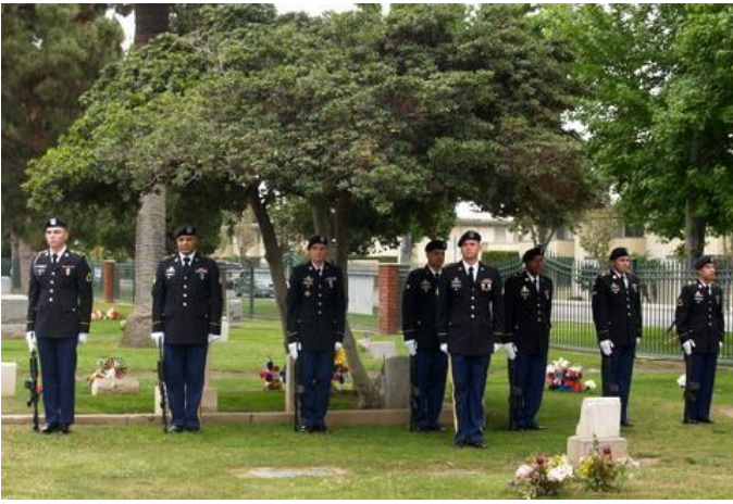
The Honor Guard Firing Party stands vigil as they await the time for the 21 gun salute.