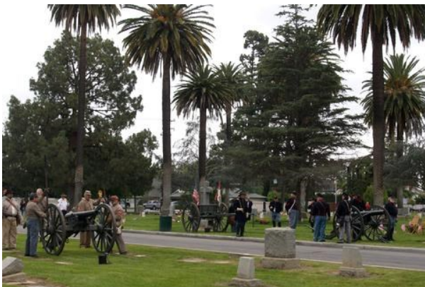
Cooper's Battery prepare for the firing of their Richmond Howitzers.