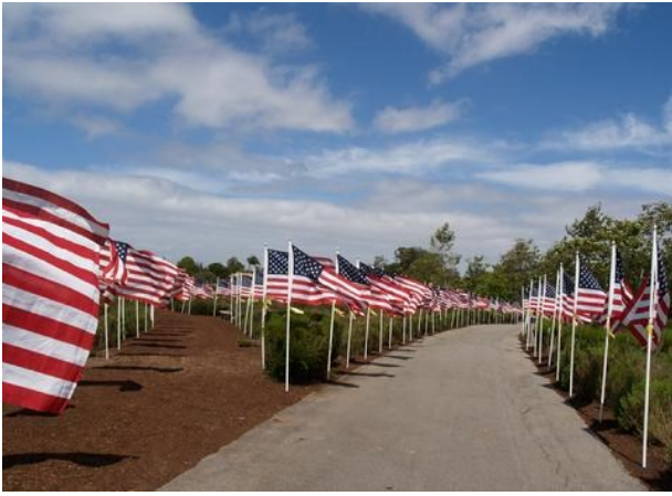
The Field of Honor was on the weekend of May 20,21, &22nd at the castaways Park in Newport Beach. There were 1776 flags placed around the park.