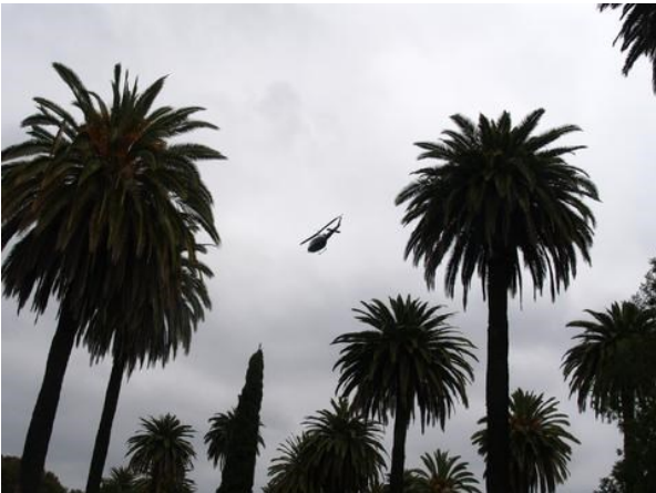
Flyovers by both helicopter and planes were witnessed at the ceremonies.