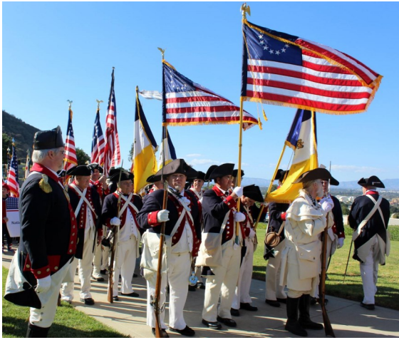
Here are photos from the Massing of the Colors at Forest Lawn in February. This would have been in the March issue had my computer not died on your editor.