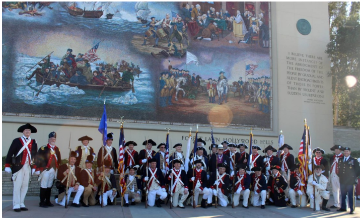
Above you see a couple photos of the entire SAR Color Guard.