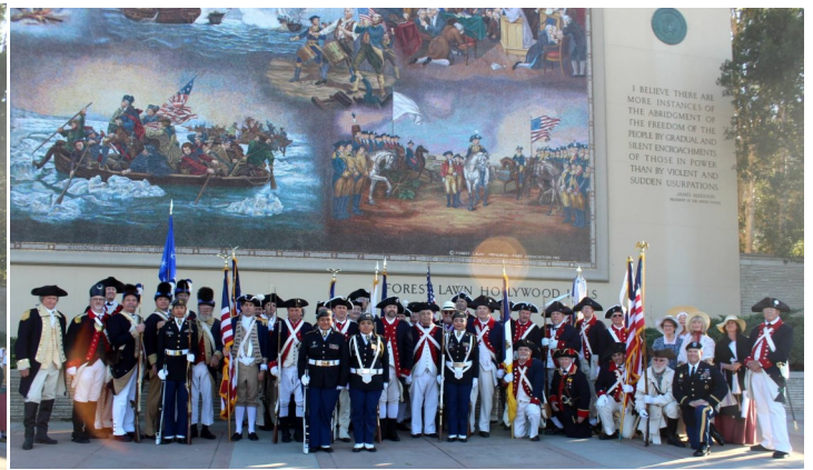
Above the Color Guard from the SAR are joined by those from the Sonora high school JROTC unit that participated in the procession.