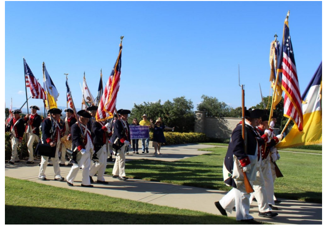
At left and above are your Lee's Legion preparing to march in the procession of colors from the various groups in attendance.