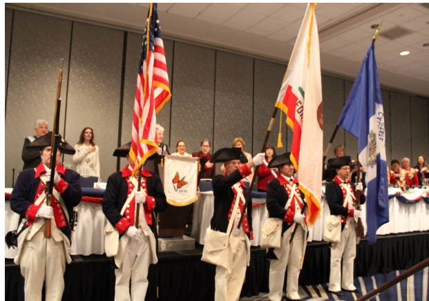
Photos of the Color Guard at the DAR conference.