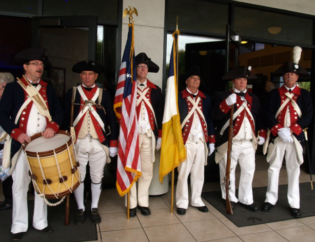
At right the Color Guard Presents the Colors.