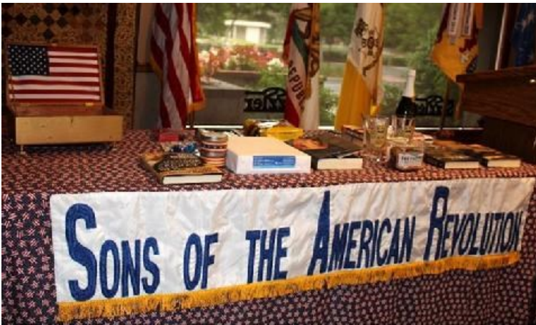
Above, Raffle items for the monthly drawing of the Ben Franklin are placed on display for all to see.