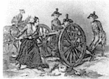
Molly Pitcher handles the cannon, loading and firing it.

As the British under General Clinton evacuated Philadelphia and headed back to New York City, General Washington sent troops after them. John's regiment was sent to Freehold, New Jersey and on June 28th his regiment was enjoined in the Battle of Monmouth. Veterans will speak about being in the heat of battle. This took a literal meaning this day as the heat was devastating. As a gunner in the artillery John Hays manned a cannon that he and a team fired upon the enemy. Because of the sweltering heat it was not uncommon for the men to call for water. In those days it was also a common for a woman named Mary to be called Molly. In the heat of battle Molly would bring the men water to help rehydrate them in this intense heat. So it was that the men would call out "Molly, Pitcher", referring