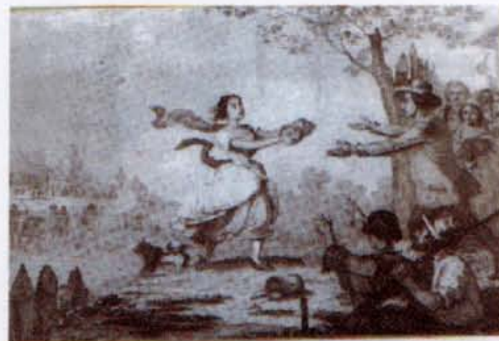
Lithograph from 1851 celebrating the "Gunpowder Run."