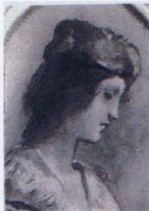
Elizabeth "Betty" Zane July 19, 1766- August 21, 1823

Betty received an education in Philadelphia after