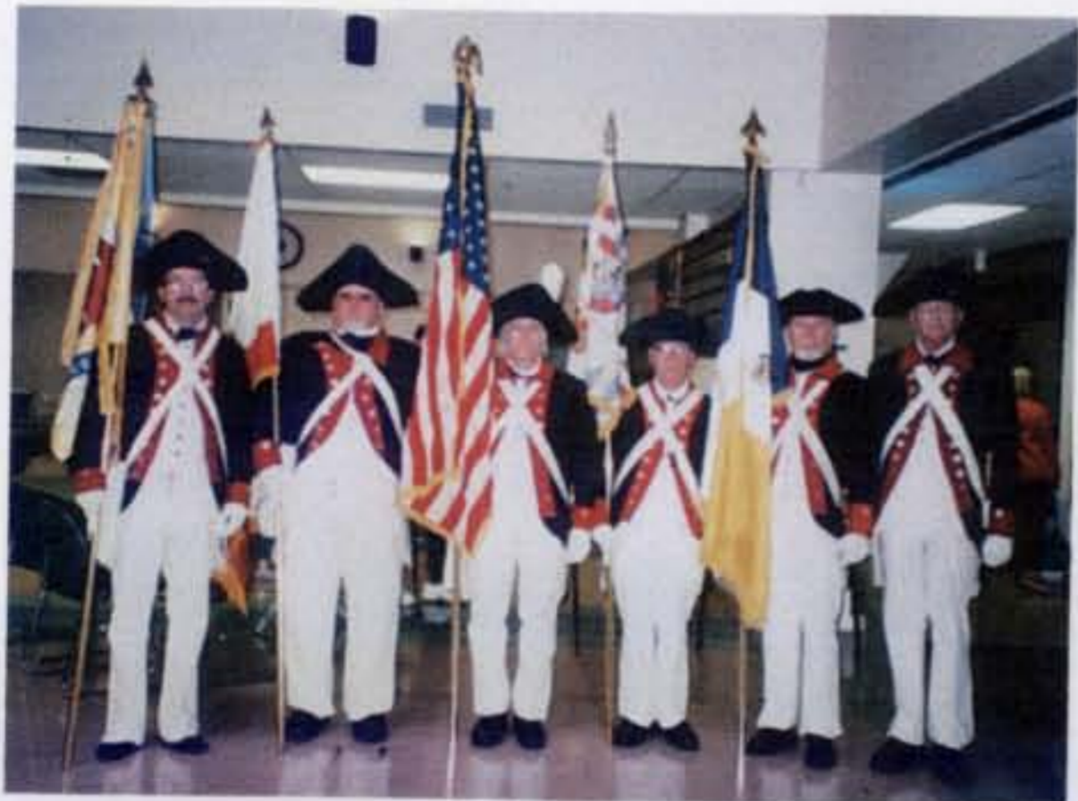
Lee's Legion of Light Dragoons of Virginia