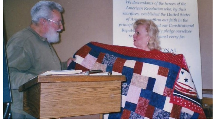
A wounded Warrior he was presented with a quilt from the Quilts of Valor Organization.