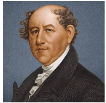
Rufus King 1755-1827

Democrats attacked Cassius Marcellus Clay and shot him in the chest, but he was able to fight them off with his Bowie knife. Clay began publishing an anti-slavery newspaper in 1845 called The True American . He received death threats and had to barricade his newspaper office doors. A mob broke in and stole his printing equipment. In 1849, while making an anti-slavery speech, Clay was attacked, beaten, stabbed, and almost shot, till he fought off his attackers. Cassius Marcellus Clay helped pressure Lincoln to issue the Emancipation Proclamation. As Minister to Russia, Clay helped negotiate the U.S. purchase of Alaska.