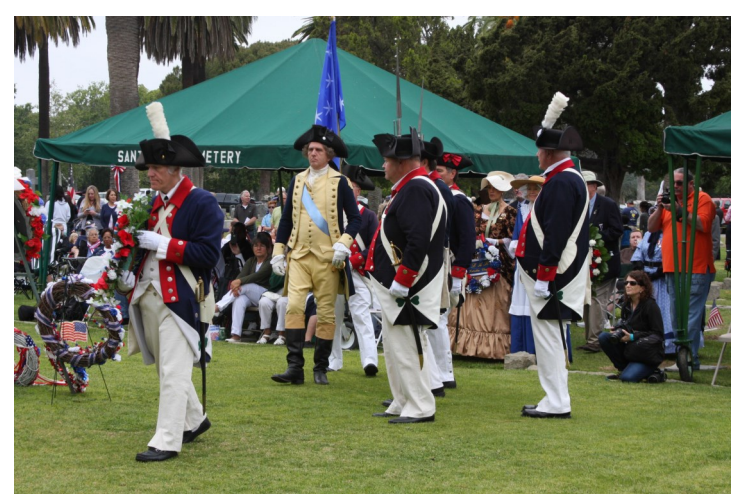
As Compatriot Blauer proceeds to the monument to lay the wreath, the Color Guard forms up as General Washington and his Flag bearer follow.