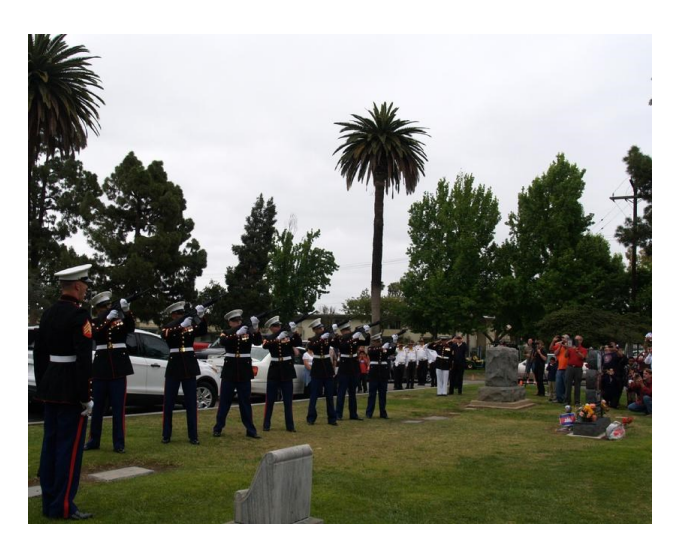
Above a Marine Rifle team fire off a 21 gun salute to the veterans who died in service to our country.

At left is the staging area behind the monument, where you can see that wreaths have been presented, by the various hereditary and Veterans organizations, at the base of the monument.