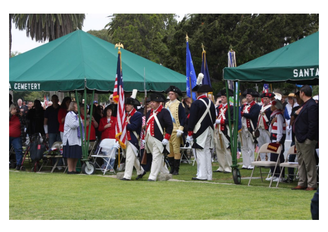
Above, the Lee's Legion Color Guard prepares to march and present their colors at this service.

Local Civil War reenactors fire off a couple of cannon. These firings caused many an alarm to go off on nearby vehicles.