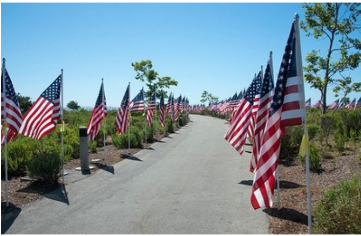
One of the many walkways lined with American Flags.

“In 2003 the citizens of Newport Beach adopted the 1st Battalion, 1st Marines, 1st Marine Division. The city dedicates this memorial in honor of the men and women of 1/1 who paid the ultimate price in defending and preserving our Nation and our Freedom.” reads the inscription at right.