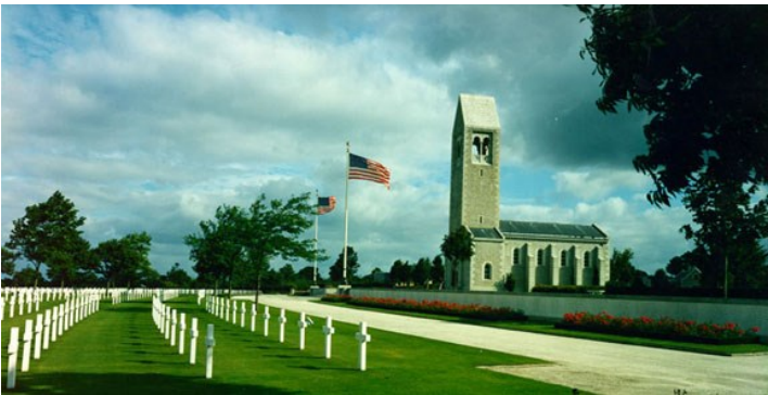
The American Cemetery at Brittany France... A total of 4,410