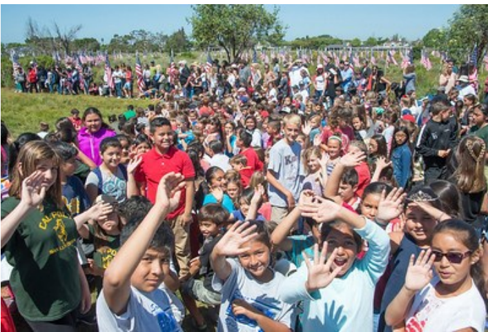
Elementary School children were bussed to the park for them to learn about Armed Forces Weekend and the Field of Honor.