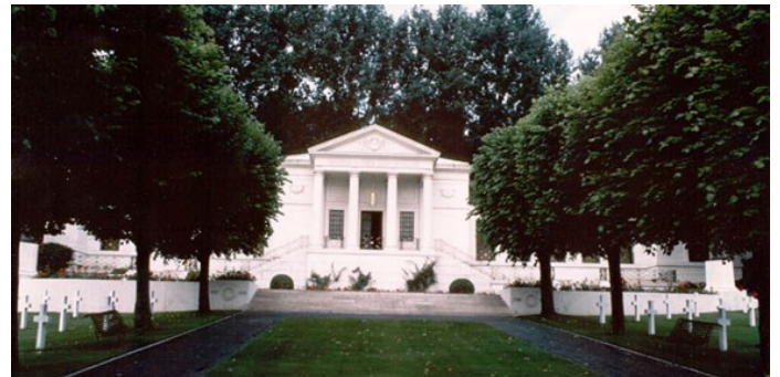
Suresnes, France... Total of 1,541

These are just 20 of the 53 known American Military cemeteries, monuments and memorials where our men and women are buried.