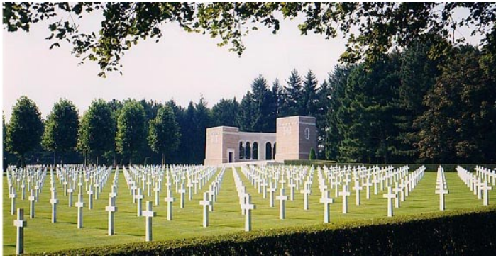
Oise-Aisne, France... A total of 6,012