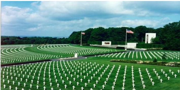
Luxembourg, Luxembourg.. A total of 5,076