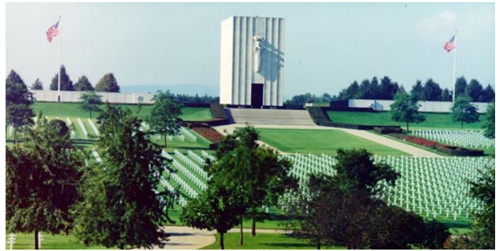
Lorraine, France... A total of 10,489