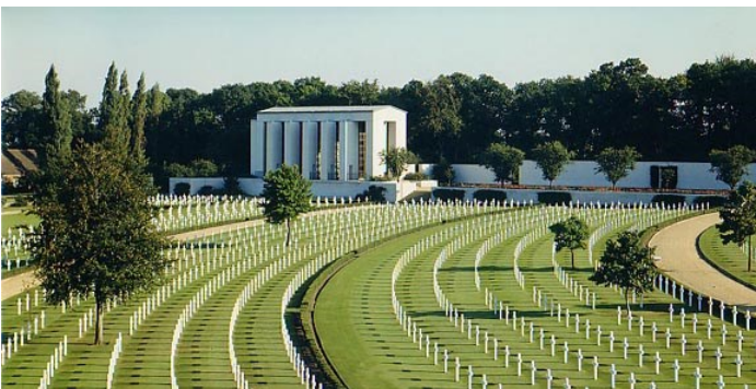
Cambridge England... A total of 3,812