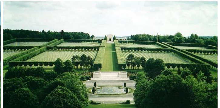
Meuse-Argonne... A total of 14,246