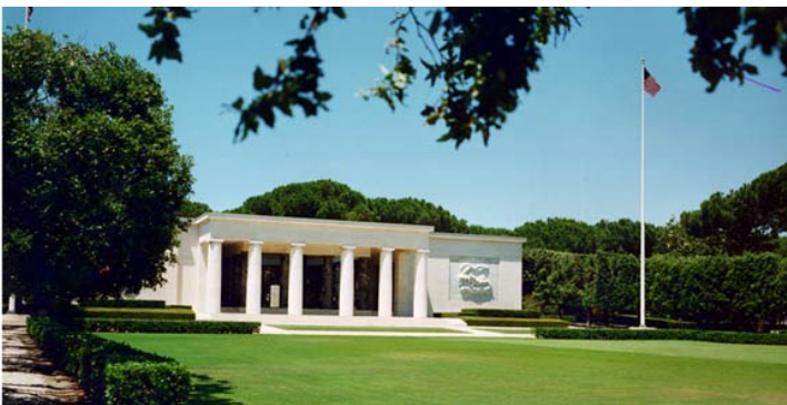
Sicily, Italy... Total of 7,861