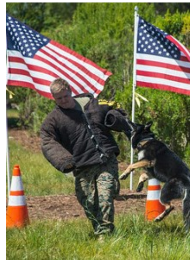
A canine attack dog gives a demonstration of what the dog might do when told to attack.