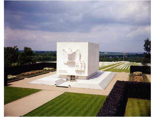
The American Cemetery at Ar- dennes, Belgium.. Total 5,329 .