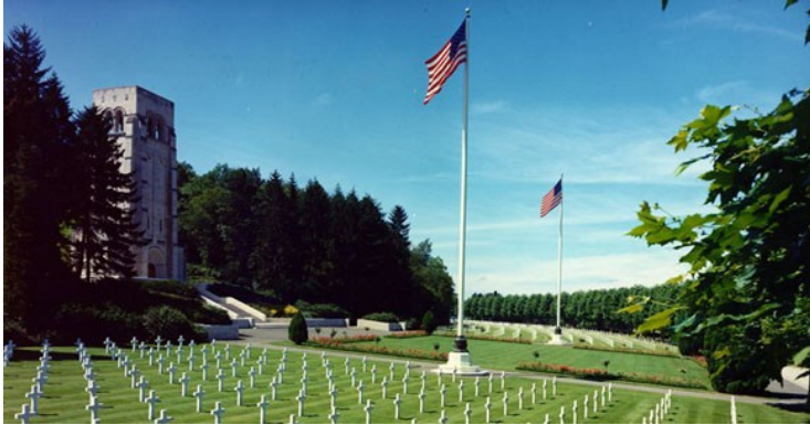
American Cemetery at Aisne-Marne, France.. Total 2,289 .

A day of Remembrance of those brave men and women who have given their lives for the cause of Freedom.