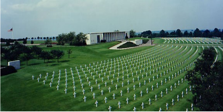
Henri-Chappelle, Belgium... A total of 7,992