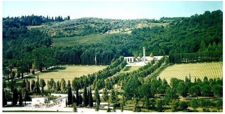
Florence, Italy.. A total of 4,402