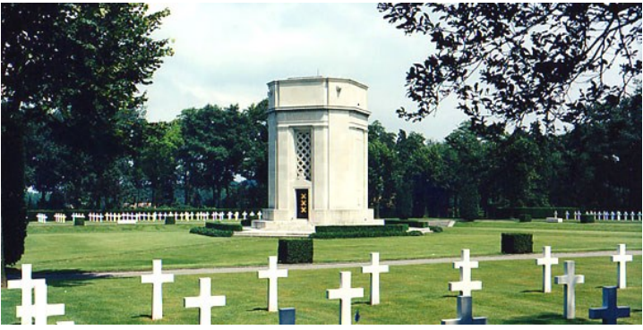
Flanders's Field, Belgium... A total of 368