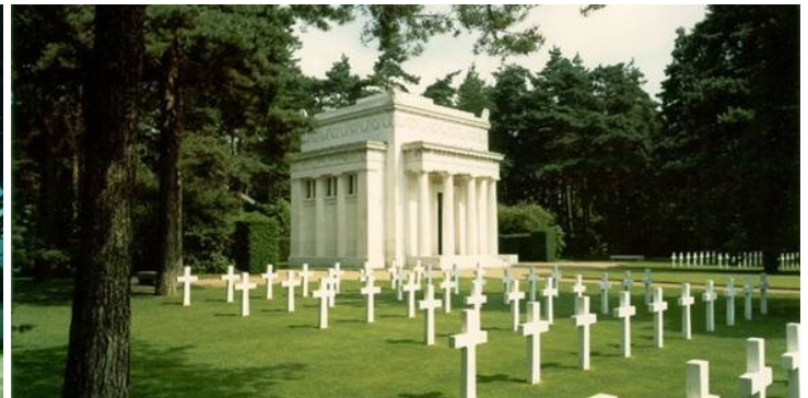
Brookwood, England—American Ceme- tery... A total of 468