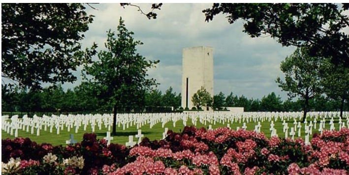
Netherlands, The Netherlands... A total of 8,301