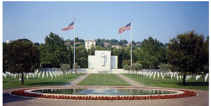
Rhone, France... A total of 861