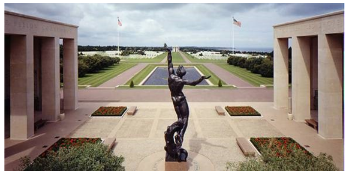
Normandy, France... A total of 9,387