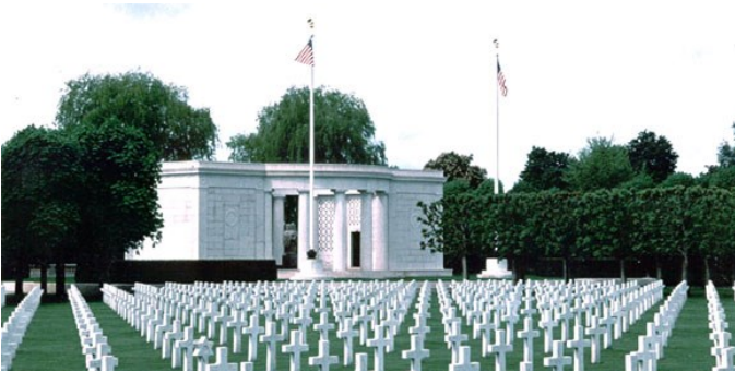
St. Mihiel, France... Total of 4,153