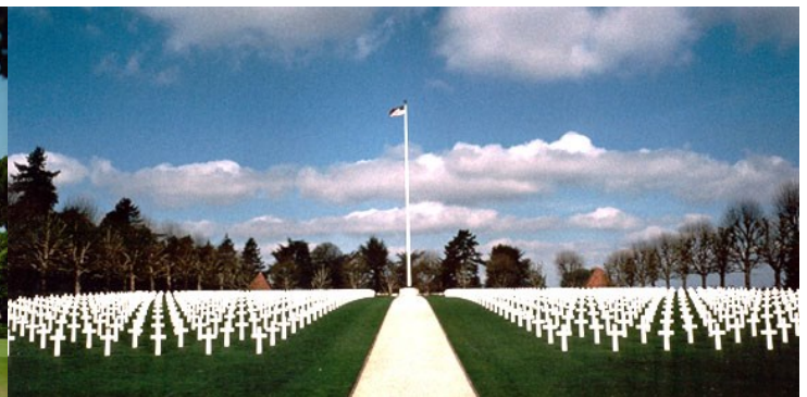
Somme, France... Total of 1,844