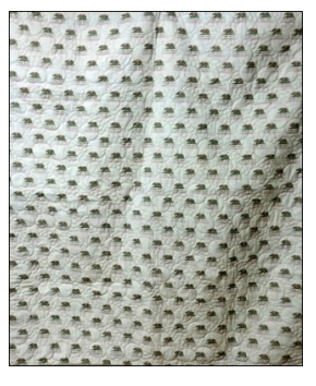
Un Hui Yi's quilt she made at Quilts of Valor has a California flavor to it. She is selling tickets to the drawing for 1 for $2.00 or 3 for $5.00.

where she is a volunteer quilter for the Quilts of Valor.