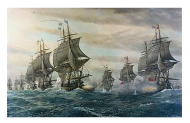
Battle of the Chesapeake where the French defeated the British forcing Cornwallis to surrender.

As the British surrendered their weapons the French musicians were ordered to play Yankee Doodle, a song the British created as a derogatory slur on the Americans, but taken up by the Americans as a rallying song. Claiming illness, Cornwallis sent Brigadier General Charles