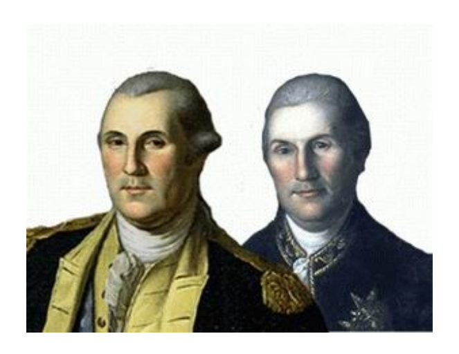
General George Washington and Lt. General Jean de Rochambeau

the Chesapeake Bay. As Washington's troops headed south, Lieutenant General Jean de Rochambeau led his French troops out of Rhode Island to join up with General Washington. The French Fleet at Newport, Rhode Island joined De Grasse's Fleet in Chesapeake Bay. With 17,000 troops Washington with the Continental Army was able to surround Yorktown on September 28, 1781.